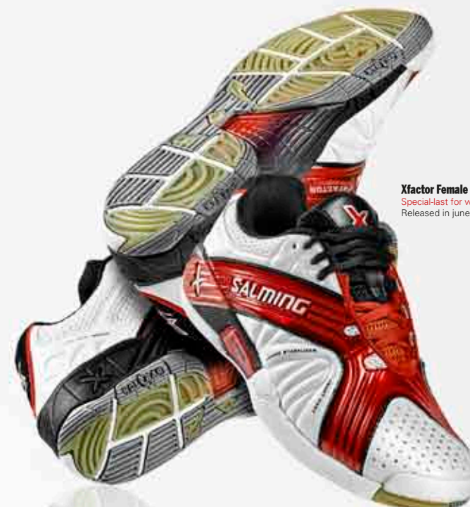
Xfactor Female Special-last for woman Released in june 2011