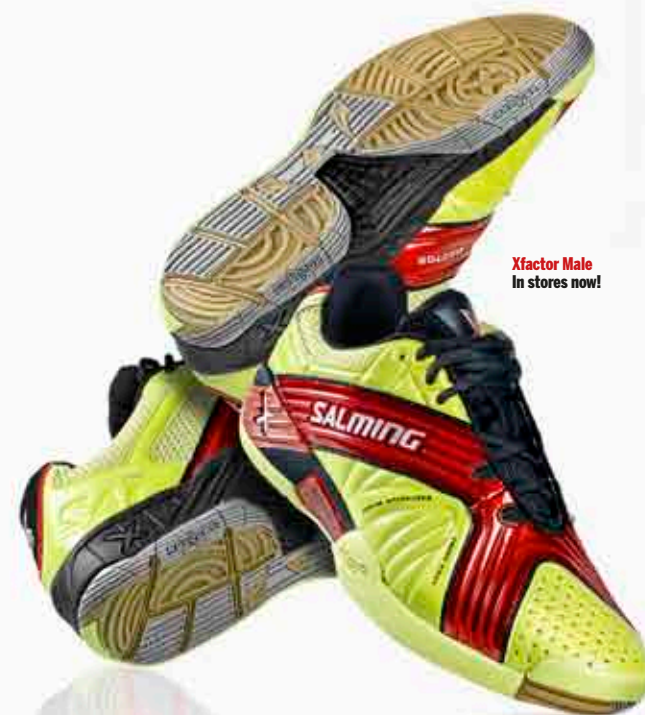
Xfactor Male In stores now!