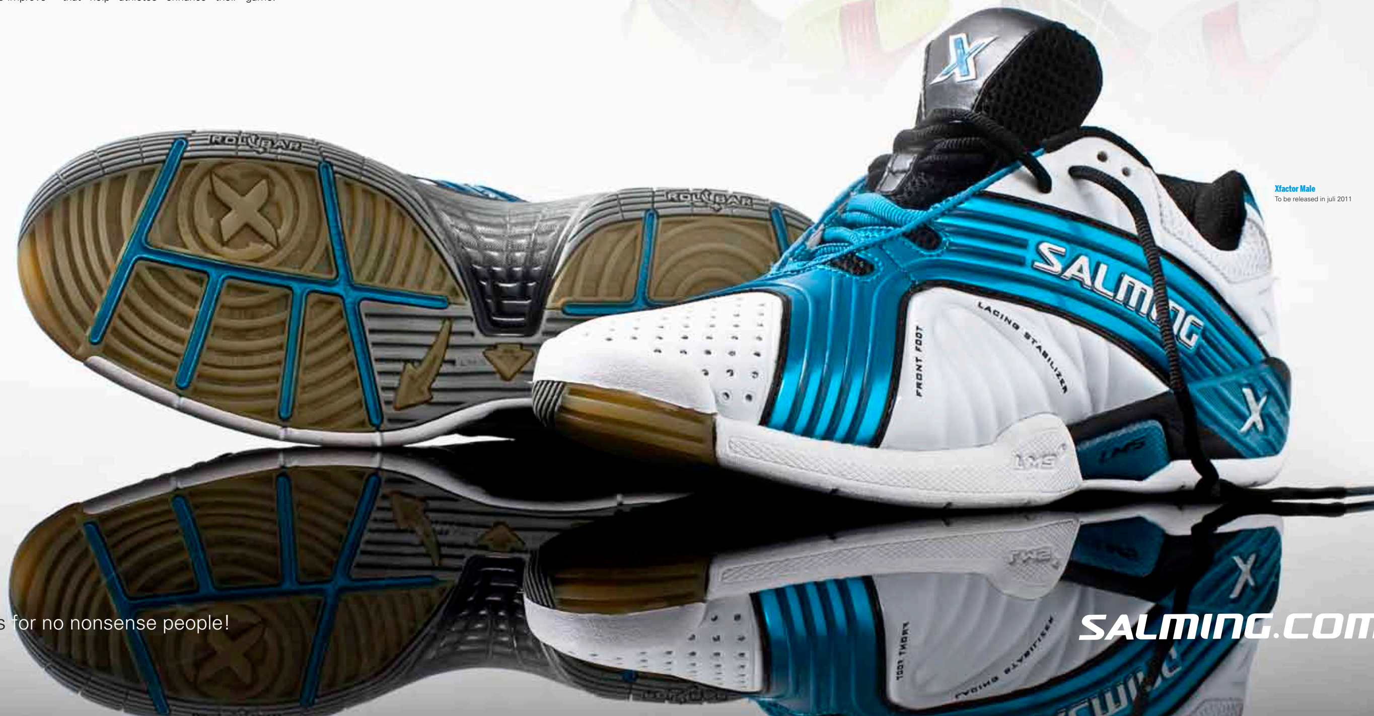
Xfactor Male To be released in juli 2011

no nonsense shoes for no nonsense people!